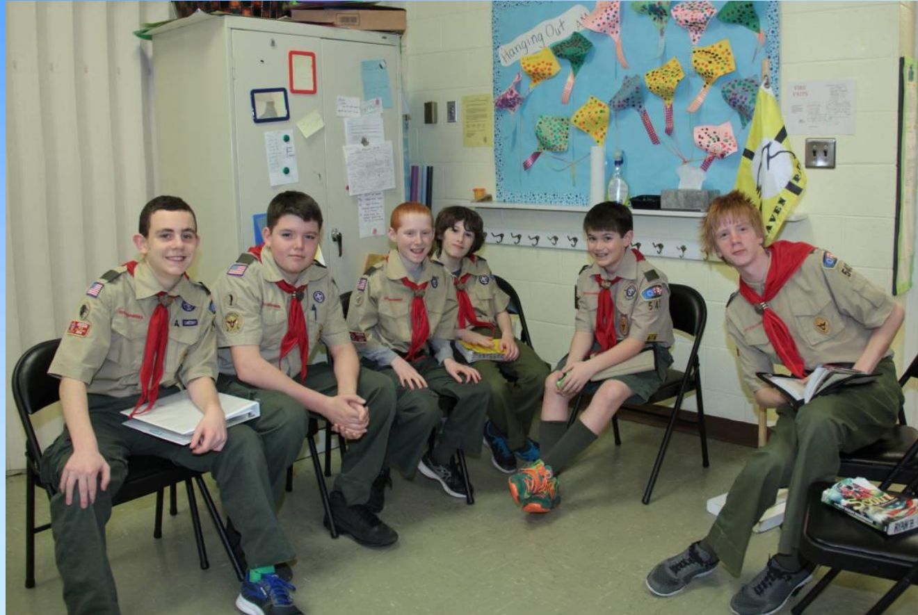
A Troop 542 patrol during patrol time