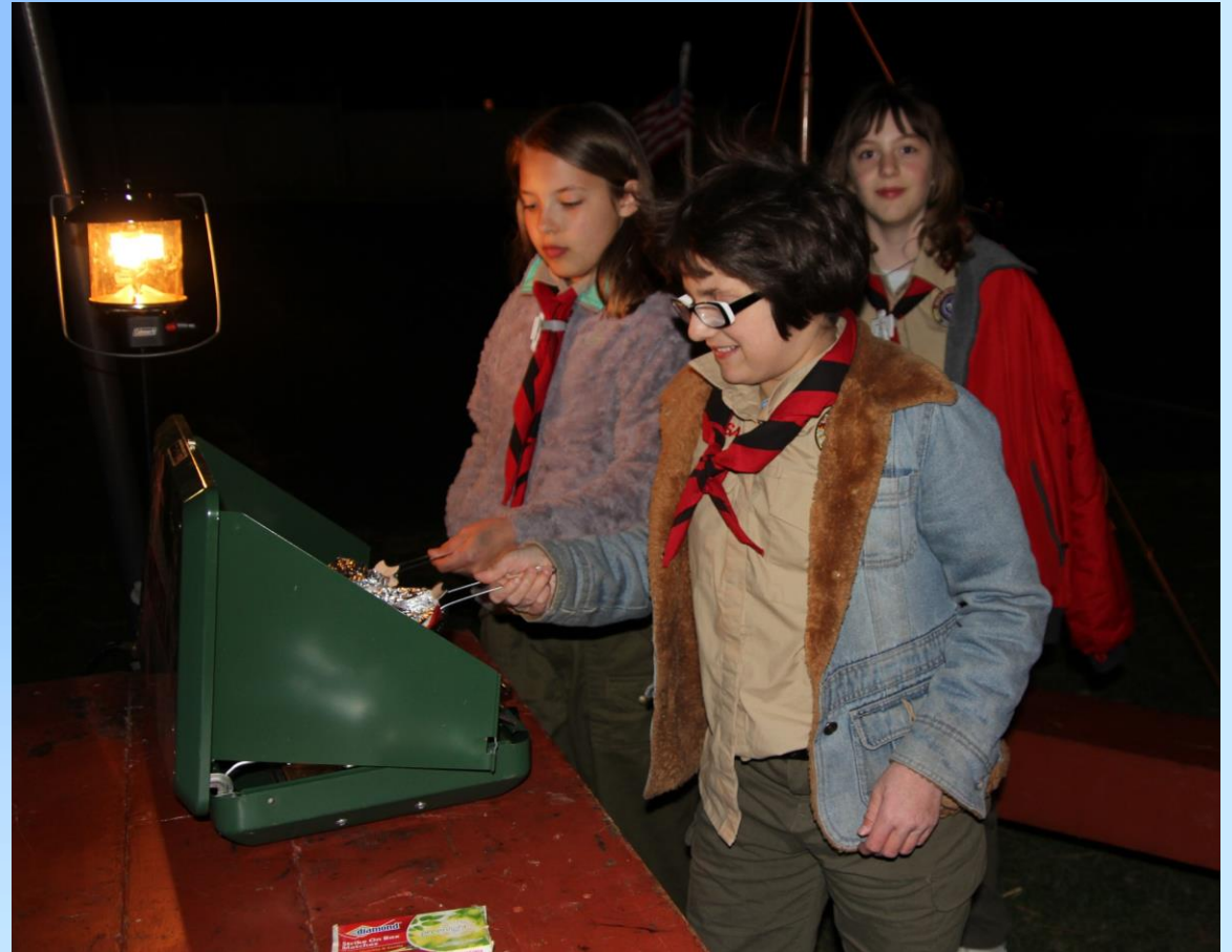
First year girls learn to set up a cooking area on the church lawn at a meeting